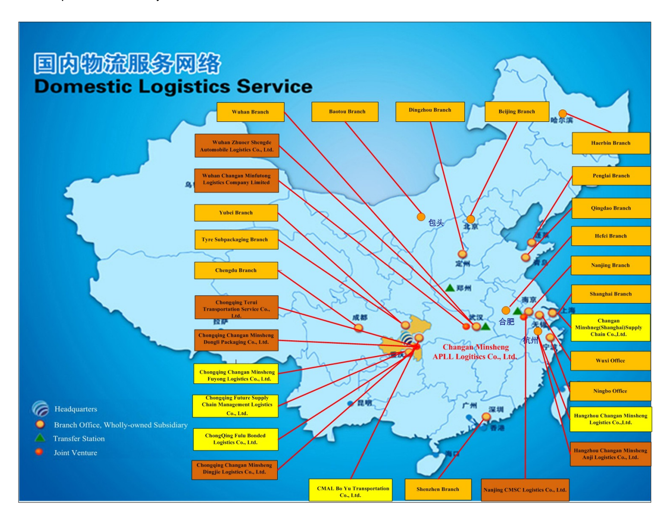
Chart 2: Location of the Company's existing branches, subsidiaries and representative offices

As at 31 December 2015, the Company had a total of 29 branches, subsidiaries, associated companies and representative offices, which are mainly located in East China, Central China, North China, South China and Southwest China (Chart 2). The continuous enhancement of service network enables the Group to provide logistics services to different parts of the country.