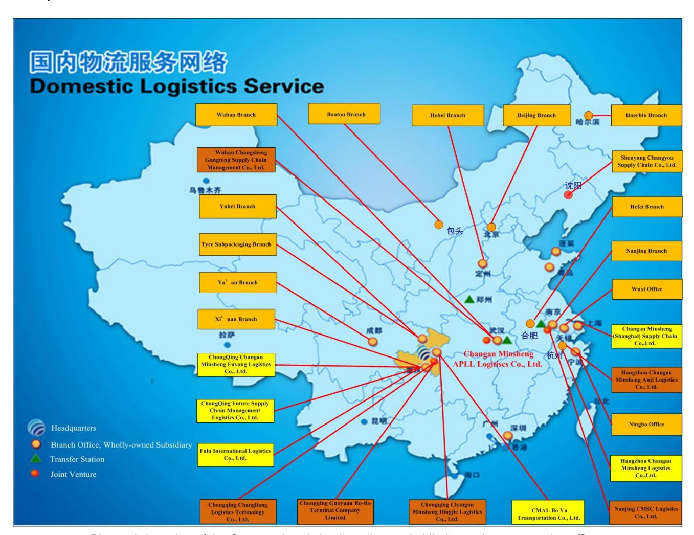
Picture 2: Location of the Company's existing branches, subsidiaries and representative offices

As at 31 December 2019, the Company had a total of 26 branches, subsidiaries, associated companies and representative offices, which are mainly located in East China, Central China, North China, South China and Southwest China (Picture 2). The continuous enhancement of service network enables the Group to provide logistics services to different parts of the country.